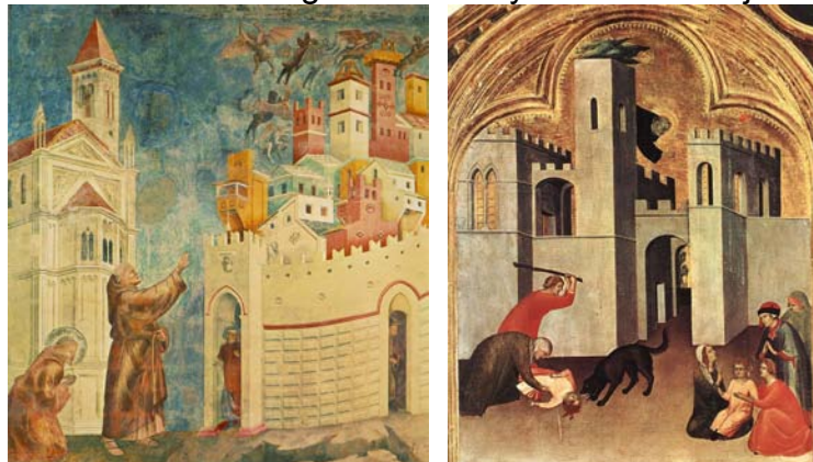
Giotto, “La cacciata dei demoni”, Simone Martini, “Beato Agostino Novello e il bambino azzannato dal lupo”

An explicit example of this approach are the tables and the frescoes by Giotto and Simone Martini. In these representations of medieval cities, each architectural event is represented by a different “perspective”, constructed with a subjective, ever-changing, virtual viewpoint that dynamically relates to one of multiple subjective paths for exploring the city. It seems that each architectural object follows one of possible subjective viewpoint able to underline a particular location in the urban image, or a point inside a discovering path in the represented environment. (C. Soddu, the not Euclidean image “L'Immagine non Euclidea”, Gangemi Pub. 1986). Looking at the urban images in these medieval artworks, and mentally reconstructing their whole urban geometry, each architecture appear as curved, physically transformed from “normal” orthogonal order by their own subjective perspective.